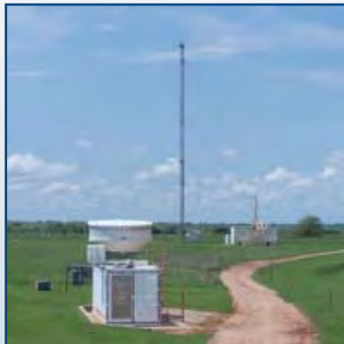
Cloud radars (foreground), a meteorological tower (background), and an aerosol observing system represent just a small portion of the remote-sensing instruments at the ARM Climate Research Facility's SGP site.

Fully established in 1994, this ARM Climate Research Facility site covers an area of about 43,000 square kilometers in north-central Oklahoma and south-central Kansas. It consists of a heavily instrumented Central Facility, plus numerous smaller facilities positioned throughout its domain. Remote-sensing instruments