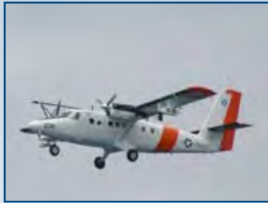
The CIRPAS Twin Otter is a non-pressurized turbo prop twin-engine aircraft that will operate at an air speed of about 100 knots during RACORO science flights.

Operated by the Naval Postgraduate School's Center for Interdisciplinary Remotely Piloted Aircraft Studies, or CIRPAS, the Twin Otter aircraft has flown numerous missions in support of scientific field campaigns. During the RACORO field campaign, the Twin Otter will be based out of Edmond-Guthrie Regional Airport, located 85 kilometers from the SGP site. Instrumentation on the aircraft will include probes and sensors to obtain the following measurements: