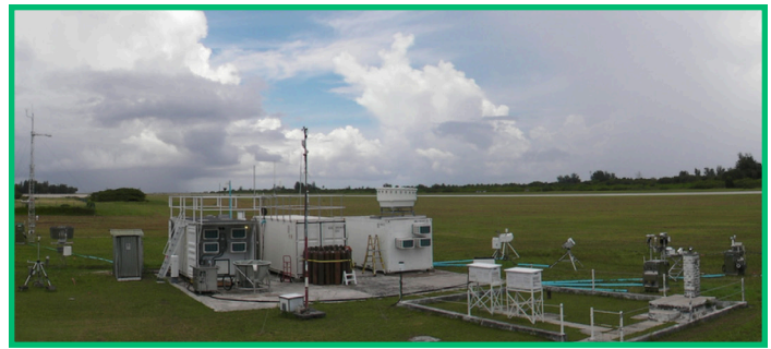
The second ARM Mobile Facility traveled to Gan Island in the Maldives to observe tropical convection for the ARM Madden-Julian Oscillation Investigation Experiment.

Data and Communication System. Continuous measurements obtained by the sensors and instruments are collected by integrated data systems. These data are routinely checked for quality and transmitted to the ARM Data Center for storage and availability to the scientific community.