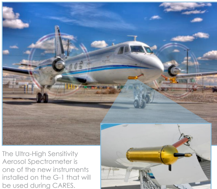
The Ultra-High Sensitivity Aerosol Spectrometer is one of the new instruments installed on the G-1 that will be used during CARES.